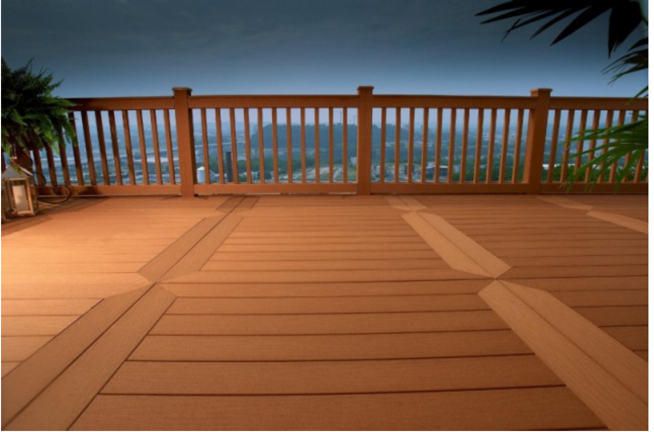
Photo of installed decking